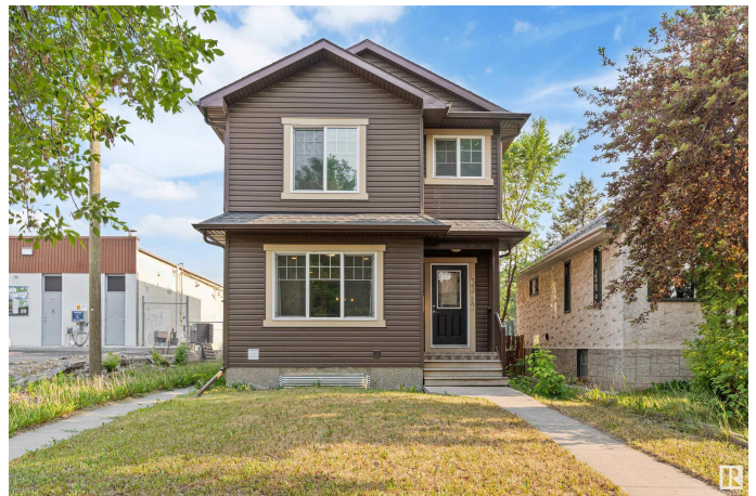
10917 71 Ave NW, Edmonton, AB

Main Building: Total Exterior Area Above Grade 113.18 m 2